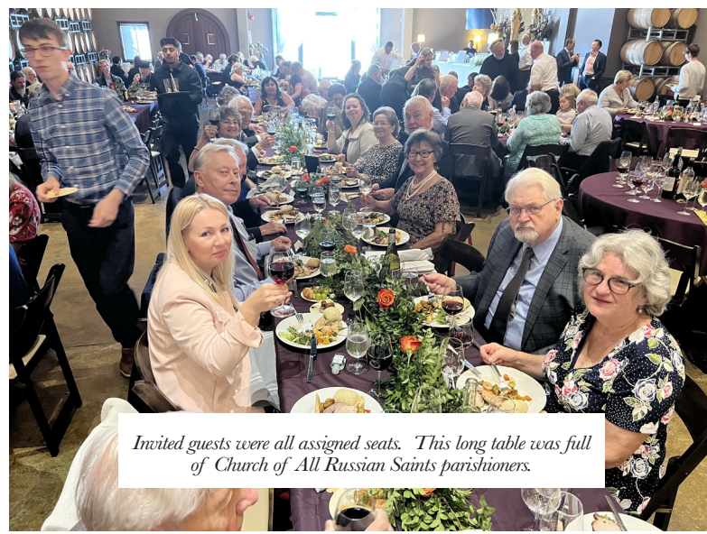
Invited guests were all assigned seats. This long table was full of Church of All Russian Saints parishioners.