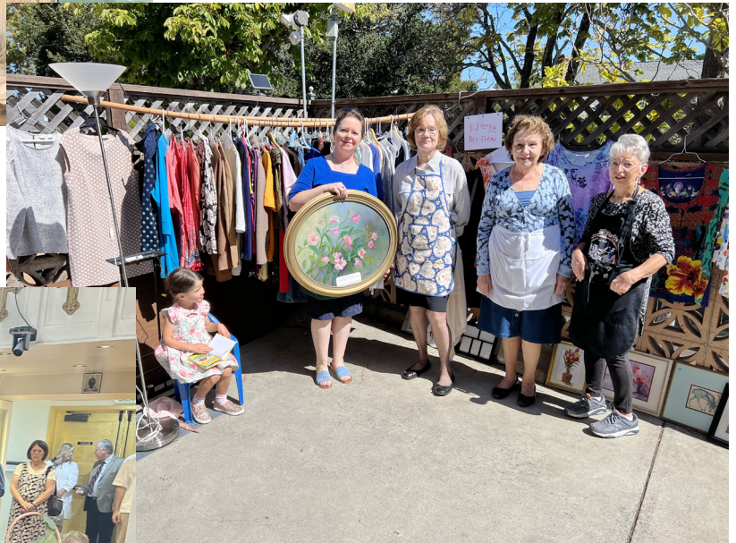
Above: With an excellent response from parishioners, members of the Sisterhood conducted a very successful Rummage Sale in August. Items not sold were sent to another Orthodox Church in San Francisco for their rummage sale.