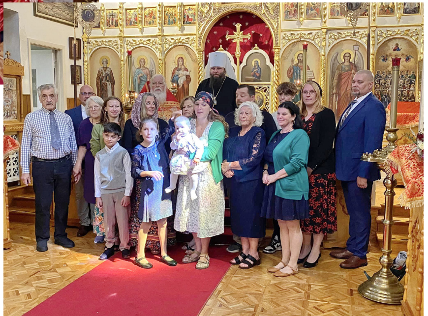
Right: Relatives of the Pawlenko family flew from the East Coast to honor the much-loved couple.