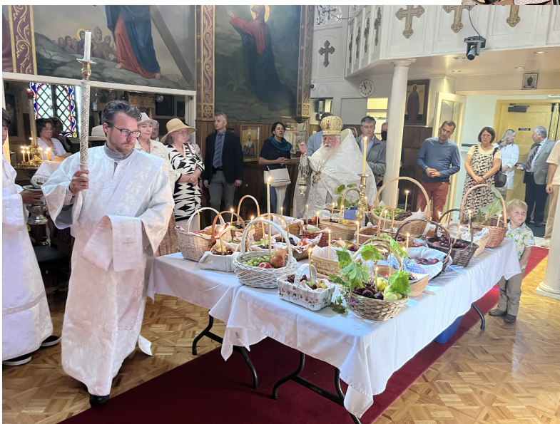
Left: Parishioners brought many baskets of fruit to be blessed on the Feast Day of Transfiguration.